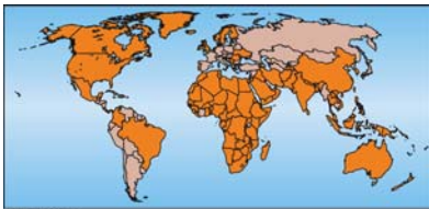
Orange-shaded countries air the Oprah Winfrey show ...but glocalization can be a complex process

If time permits: The Colonel Comes to Japan (video)