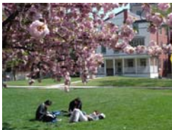
Example: college professor