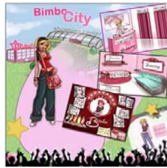
For a revealing gallery of advertising offenders, see: http://www.about-face.org/