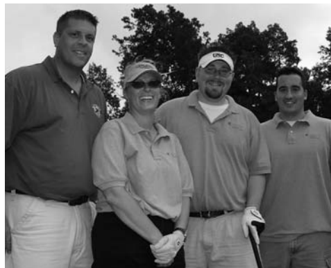
Pair Sponsor: Cendant Mortgage